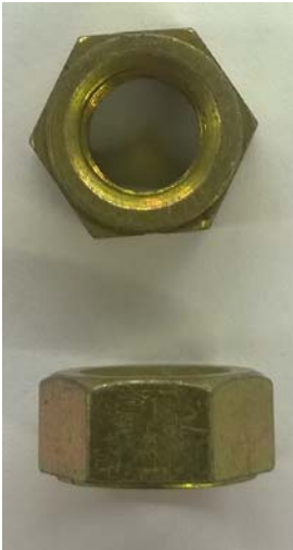
AN315-6R (Incorrect Part)